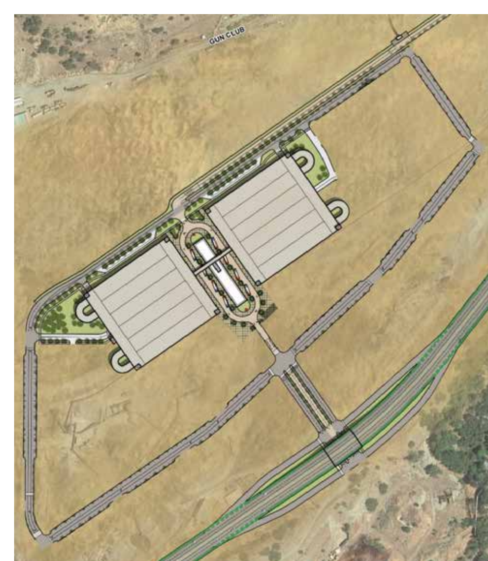
Concept of Mobility Hub at the Gravel Pit